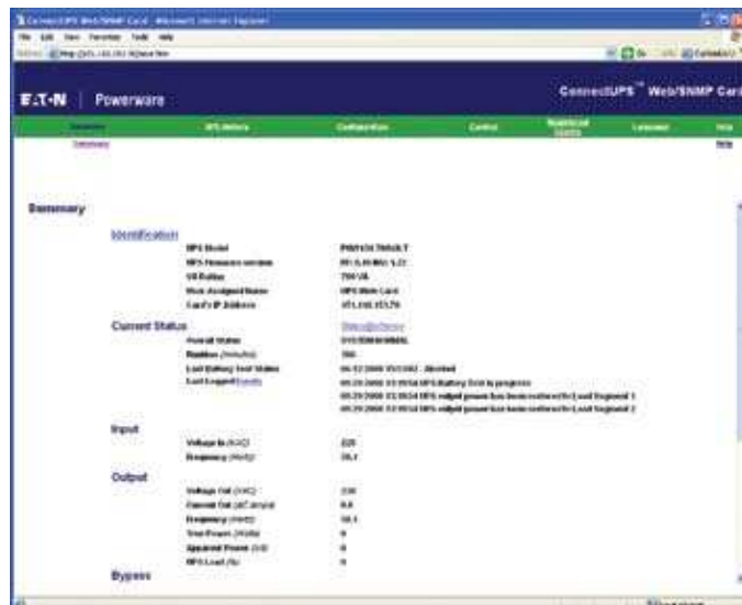
ConnectUPS-BD Web/SNMP card interface