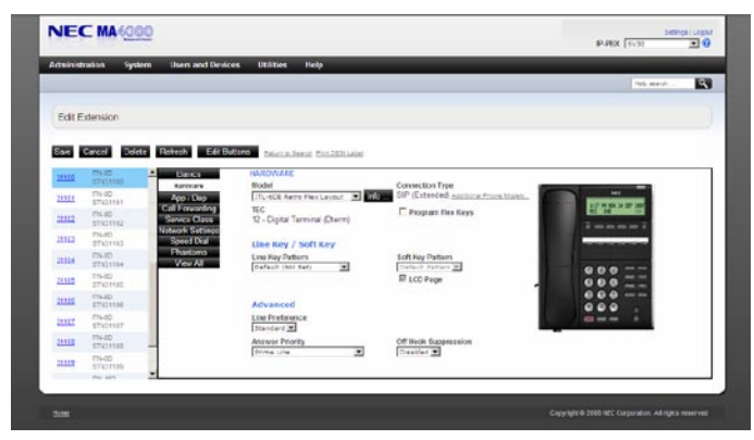
Note: Supported functionality may differ per IP-PBX.

Every element of the MA4000's web-based interface is designed to empower IT technicians and managers. Its easy-to-use GUI eliminates the need for weeks of expensive training and costly certification for administrators. Drop-down lists simplify terminal provisioning and management, and basic moves, adds and changes are handled with an intuitive wizard-like interface.